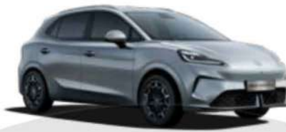
● Cosmic Silver