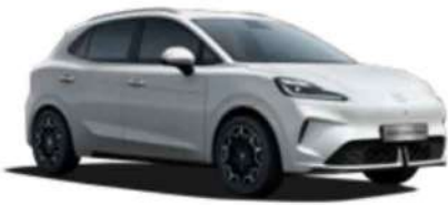
○ Arctic White