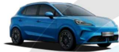
● Holborn Blue