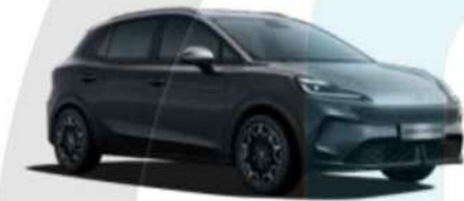
● Camden Grey