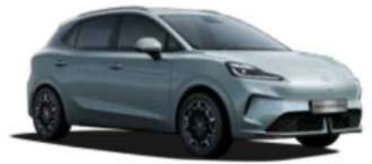
● Sage Green