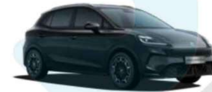
● Black Pearl