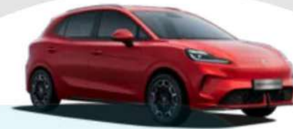
● Dynamic Red